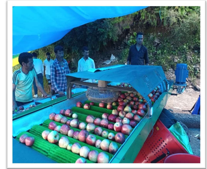
3. Apple Grading Machine