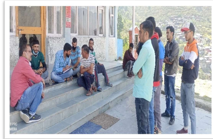
1. Awareness Camp at Salooni