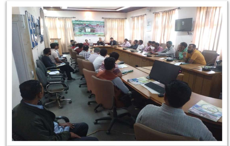
2. Training in Bookkeeping & Accounts at SAMETI, Mashobra