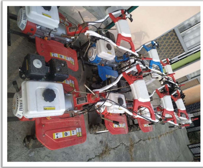
1. Power Tiller at Salooni