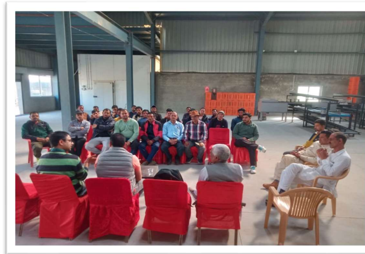
3. Exposure Visit from District Chamba