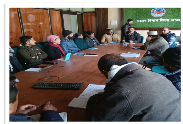
4. Capacity building of CEO & BoDs on APMC & eNAM Norms