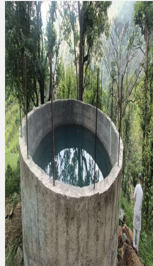
TANK NO. 7