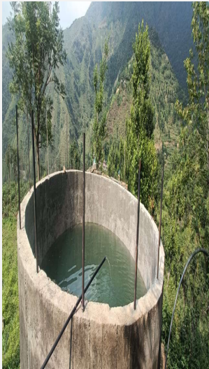
TANK NO. 5