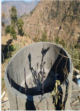
TANK NO. 1