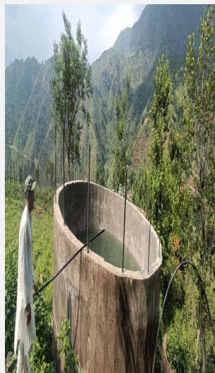
TANK NO. 6