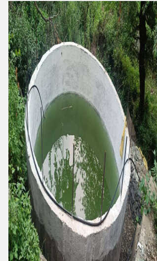
TANK NO. 8