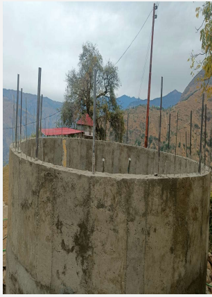
TANK NO. 2