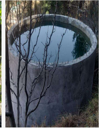
TANK NO. 4

• 8 nos. of tanks with 4 lac Liters capacity has been constructed.