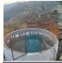
TANK NO. 3