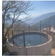
TANK NO. 5