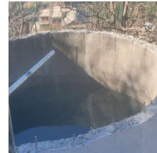
TANK NO. 6