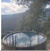
TANK NO. 2