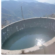
TANK NO. 4