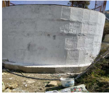
TANK NO. 4