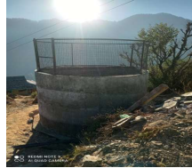
TANK NO. 5