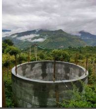
TANK NO. 1