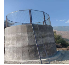
TANK NO. 6