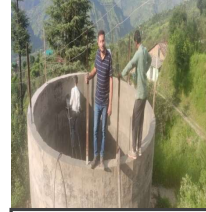
TANK NO. 3