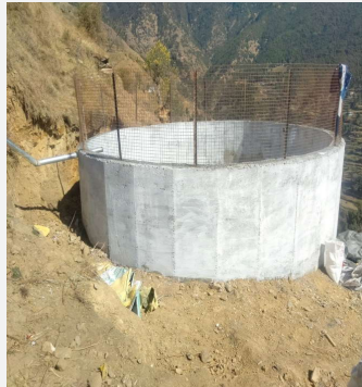
TANK NO. 2