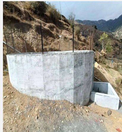
TANK NO. 6