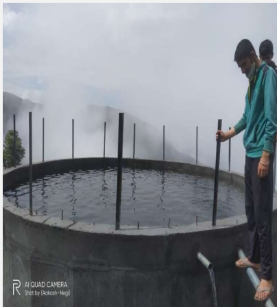
TANK NO. 5