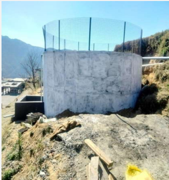
TANK NO. 1