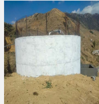
TANK NO. 3